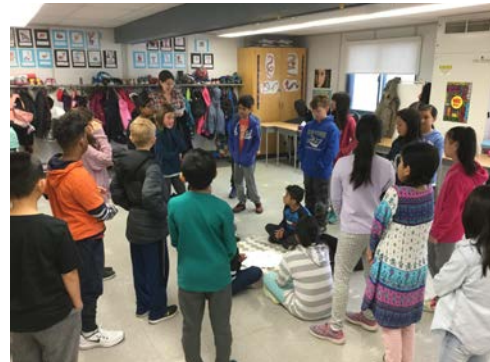
Grade 4 Blanket Ceremony